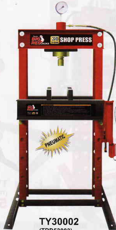
TY30002 (TRD53003) 30 TON