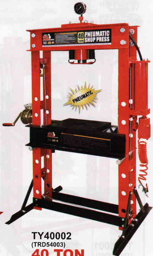
TY40002 (TRD54003) 40 TON