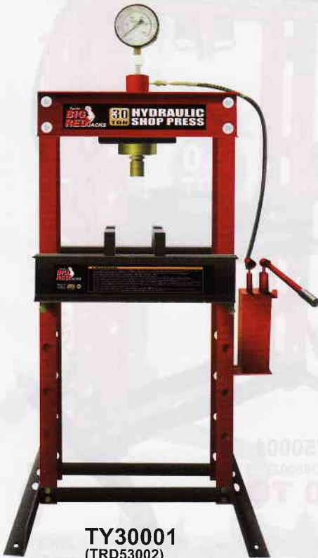
TY30001 (TRD53002) 30 TON