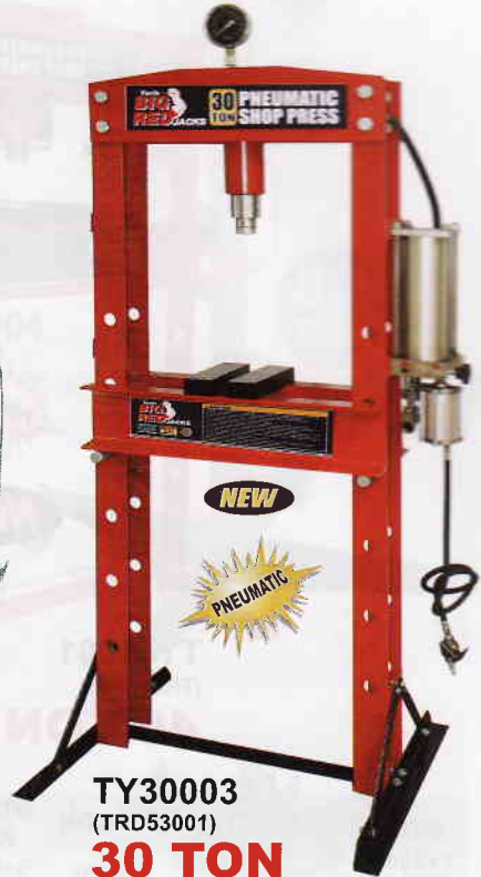
TY30003 (TRD53001) 30 TON