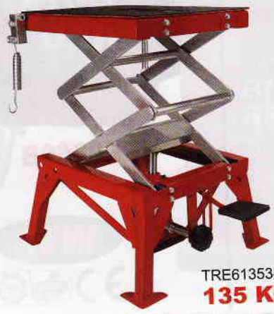
TRE61353-2 135 KG