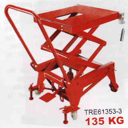
TRE61353-3 135 KG